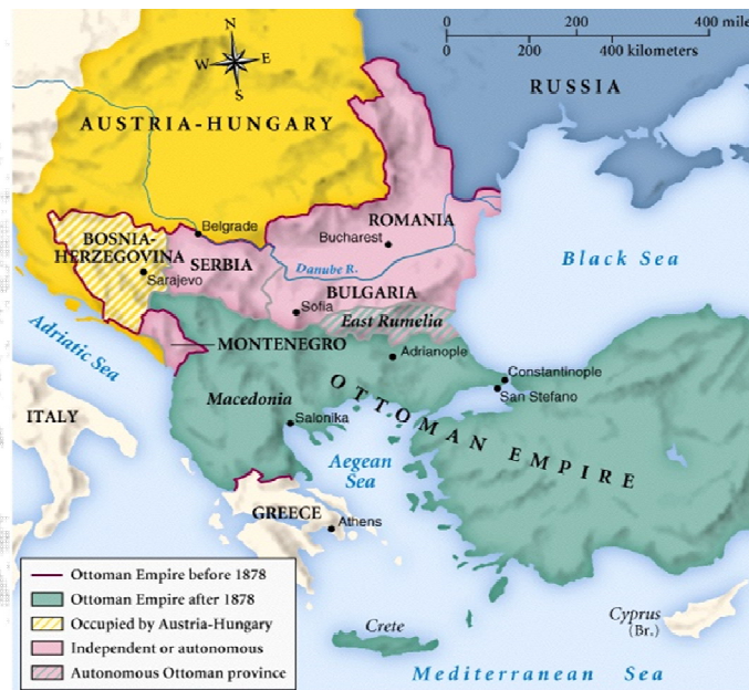
The Balkans in 1878